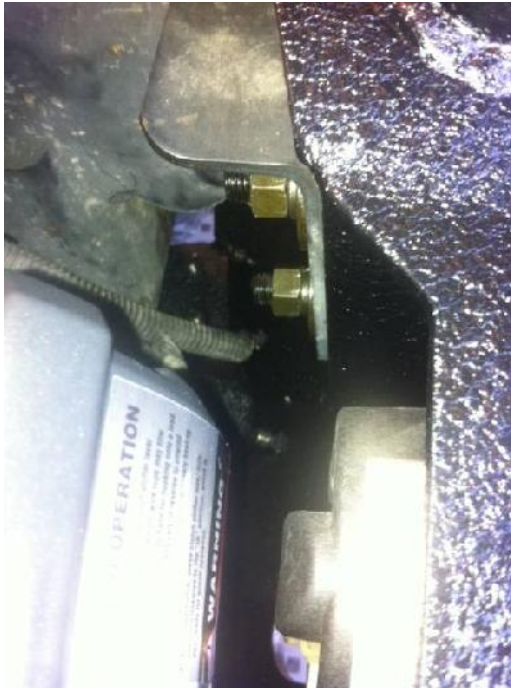
(Fig C, Driver side-Inside)