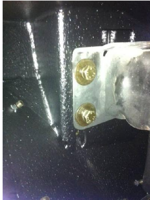
(Fig D, Driver side outside)

Step 6: Using the two outer lower center plate mounting holes on the bottom of the front bumper as a guide, center punch and drill through the factory cross member using a 13/32 "drill bit. (Fig E) Once drilled secure with included M10 hardware. (Counter Sunk bolt, washer, nut)