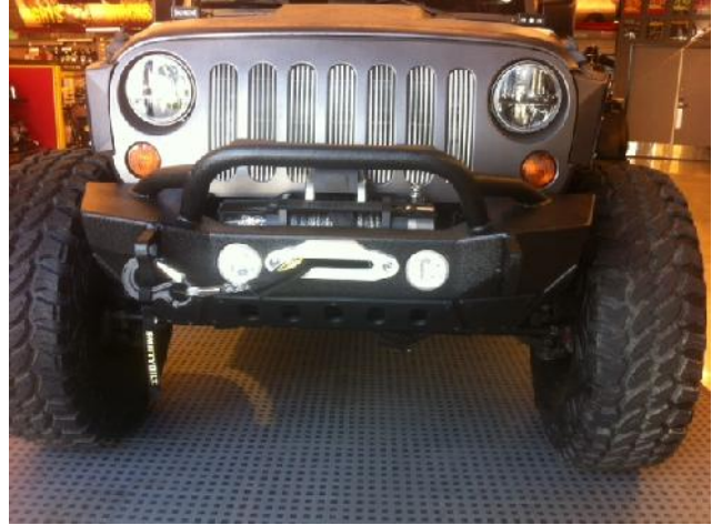
(Fig F, XRC Bumper)