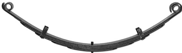
< SHACKLE END - PHOTO 7 - FRAME END (MILITARY WRAP) >